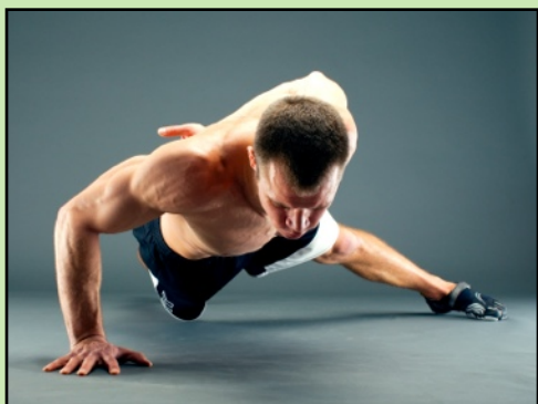
Athletes require first-class nutrition to gain a competitive edge.

Athletes are usually so focused on how macronutrients—protein, carbohydrates, and fat—affect their performance, but what about bioactive compounds and micronutrients? Can they improve performance? The answer is a resounding “yes!” Ageless Essentials Daily Pack has exactly what you need to take your skills to the next level. Here are seven powerful ingredients in Ageless Essentials that can help you gain a competitive edge: