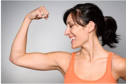
Focus on “fit and strong” and take “skinny” out of your vocabulary.

Normal-weight obesity, also known as “skinny fat,” is a growing problem in the U.S. These terms describe a person’s body composition that is high in fatty tissue in comparison to lean tissue, while still within normal limits of the body mass index (BMI). Those who are considered to be “skinny fat” do not appear to be overweight; however, they have a high percent body fat, especially visceral fat—the fat that surrounds vital organs.