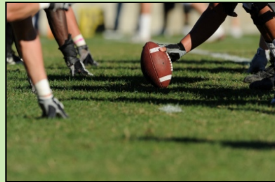
Protein is the primary substrate used by muscle to not only enhance high-intensity performance, but to also trigger muscle growth.

High-intensity athletes seek to perfect technique and train their muscles to perform the powerful functional movements necessary to their sport. They engage in activity that consists of repeated bouts of