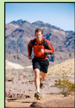
False beliefs that result in low protein intake are detrimental to endurance athletes.

Historically, much more attention has been paid to carbohydrates in maximizing endurance than protein. "Carb-loading" is a popular dietary strategy used by endurance athletes to improve performance, and involves eating foods high in starch prior to events in an effort to maximize muscle glycogen. Glycogen is the storage form of carbohydrate that can be used by the aerobic system to supply muscles with energy. With importance placed on carbohydrate consumption in endurance activities, protein is often pushed to the wayside. Many myths regarding protein intake have circulated among endurance athletes, such as the idea that high protein intake will cause bulky muscle gains that hinder efficiency, or that high protein intake is of greater relevance to strength athletes.