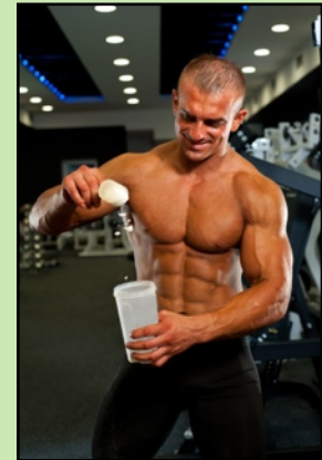
Regular amounts of protein, especially from whey, should be a central component of a dietary strategy used by strength athletes.

To optimize muscle growth and repair throughout the day, studies suggest that several meals consisting of about 30 grams of protein each should be eaten throughout the day (3).