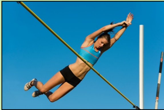
Athletes can make leaps in performance gains by getting the right type of protein, at the right time, in the right amounts.

Do I need more protein if I'm a bodybuilder? Do I need less protein if I'm a marathon runner? These are valid questions, as athletes participating in various activities manipulate their intakes of carbohydrates, fat, and protein differently to achieve their goals. The simple answer is that protein is key in optimizing the performance of all types of athletes and anyone who exercises, offering numerous advantages when consumed at levels above the recommended daily allowance (RDA). Some studies even show that athletes can benefit from as much as twice the RDA (1).