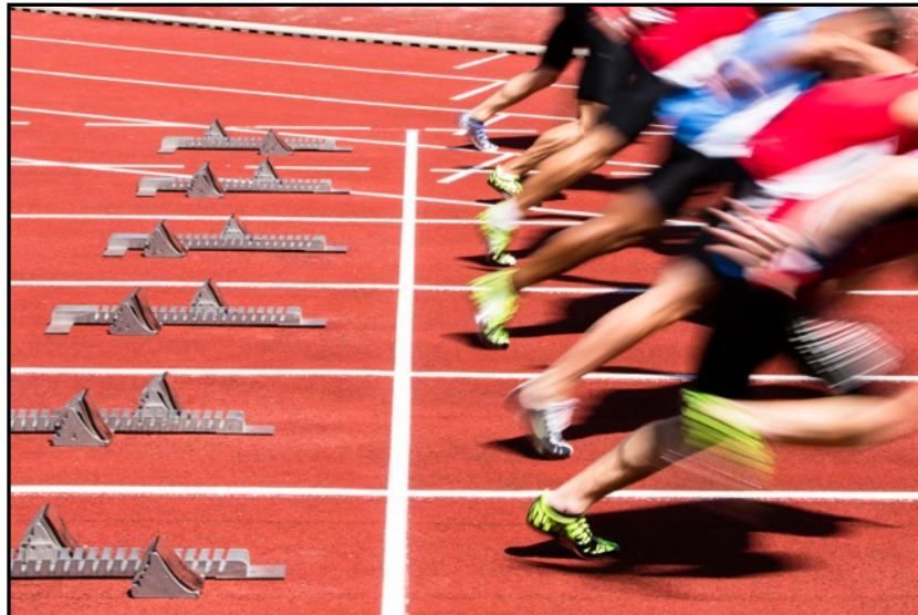
Athletes can boost speed, strength, and endurance with optimal nutrition with products that make up the Energy and Performance Pak.

Start winning with smart nutrition that's worth its weight in gold